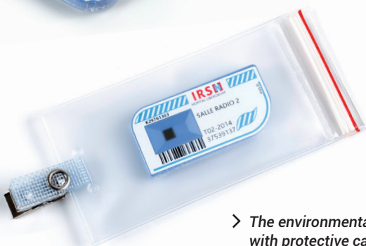
➤ The environmental dosimeter with protective case for outdoor use