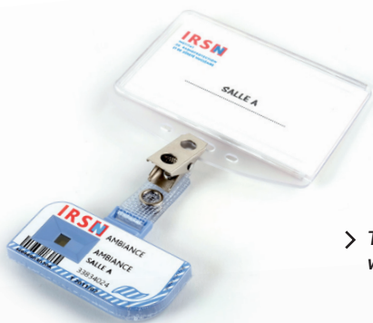
➤ The environmental dosimeter with wall-mounted holder